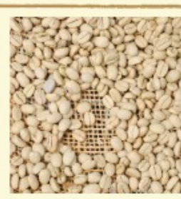
Dry, clean parchment coffee