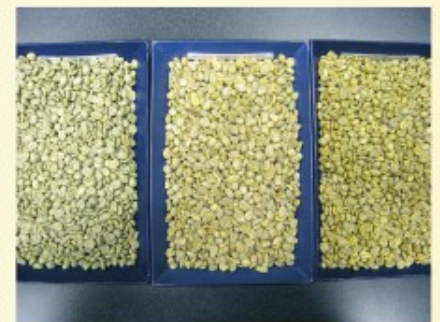
Unroasted Coffee Beans: Left - Washed Center - Rustic Right - Natural