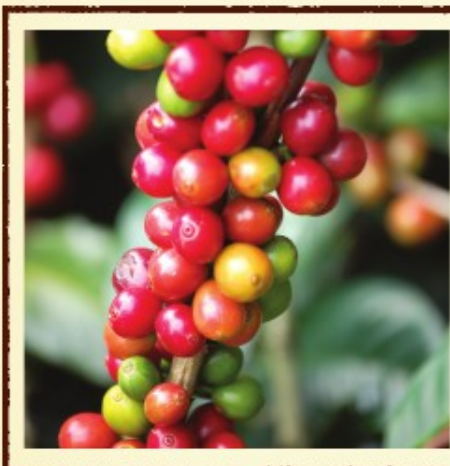
Coffee cherries of varied ripeness on the branch.

We recommend that you pair this information with a tasting of a washed, rustic and natural coffee to get the full effect.