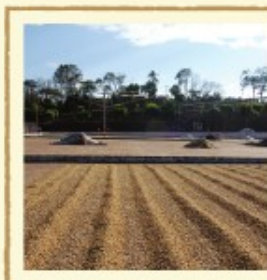
Sun drying parchment coffee on patio