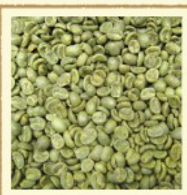
Finished green coffee (Washed Process)