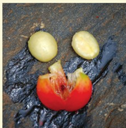
Two beans squished (pulped) from the cherry skin. The parchment casing is tightly adhered to the bean and sticky with mucilage (fruit residue).