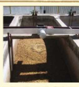
Parchment coffee in fermentation tank