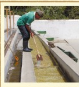
Washing parchment coffee in channel