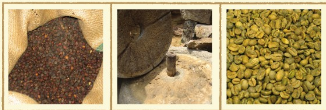
Whole, dry coffee cherries